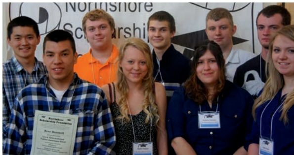
Secondary Academy for Success grads