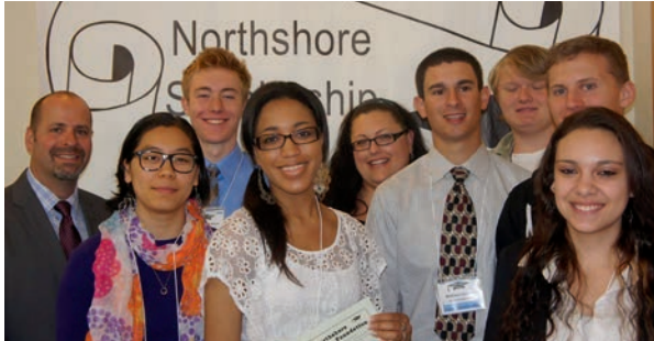
Woodinville High School graduates

Woodinville Rotary alone has paid directly for 325 of the 1,572 grants --- presently featuring our renewable "Make a Difference" grants in the amount of $7,500 at a four-year college and $3,500 at a two-year technical or community college. The club invested $192,350 in six endowment-style