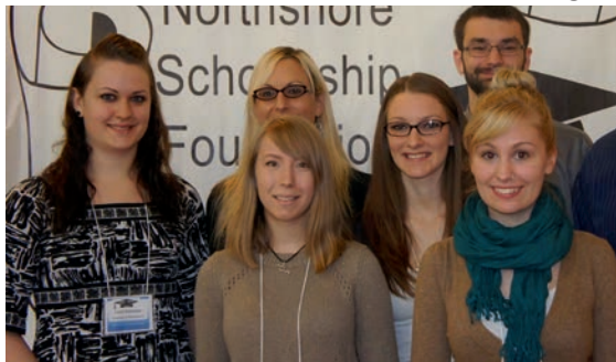
Received renewals in college